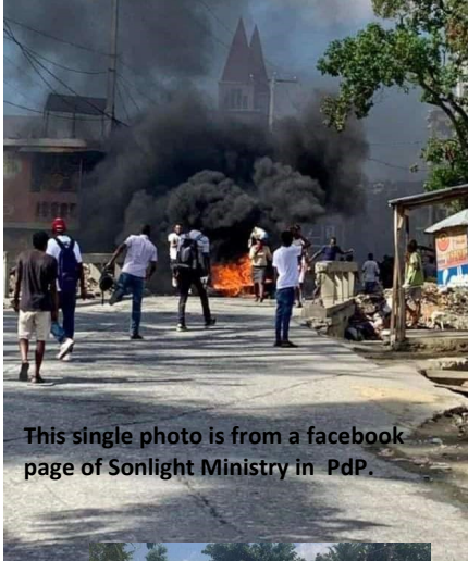
This single photo is from a facebook page of Sonlight Ministry in PdP.

In the last two months gangs moved into Port-de-Paix (PdP), Haiti. Large swaths of Haiti have already been under gang control for nearly 2 years limiting outreach to PdP and nearby areas. These are more common sights as gangs moved north ward.